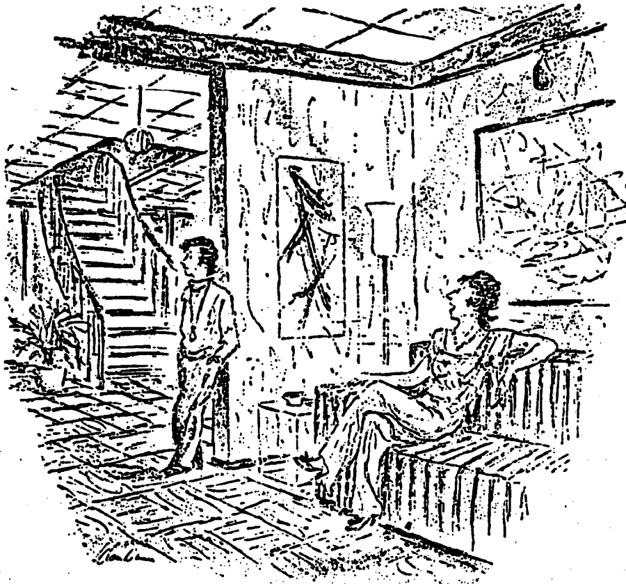
"Look, dear, I've tried to be less of a non-person and more of a mother. As if that weren't enough, now you want relevance."